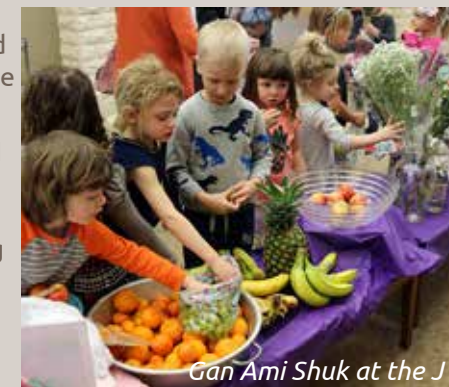
Gan Ami Shuk at the J