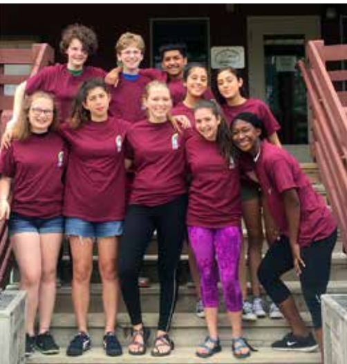
Session One CITs