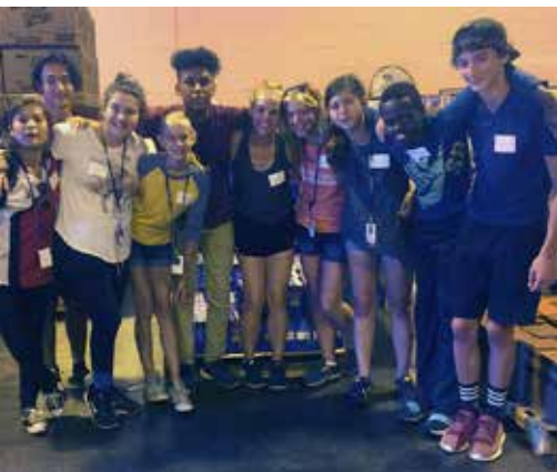
Session Two CITs