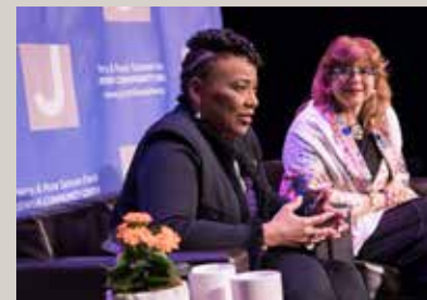
Dr. King & Professor Heschel