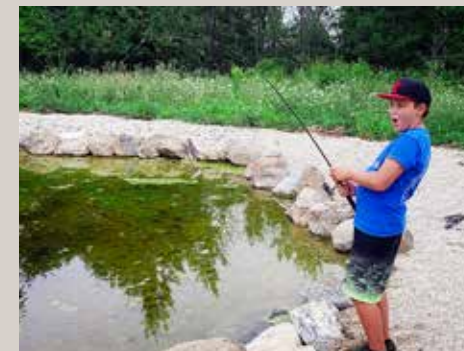
He's got a big one on the line!